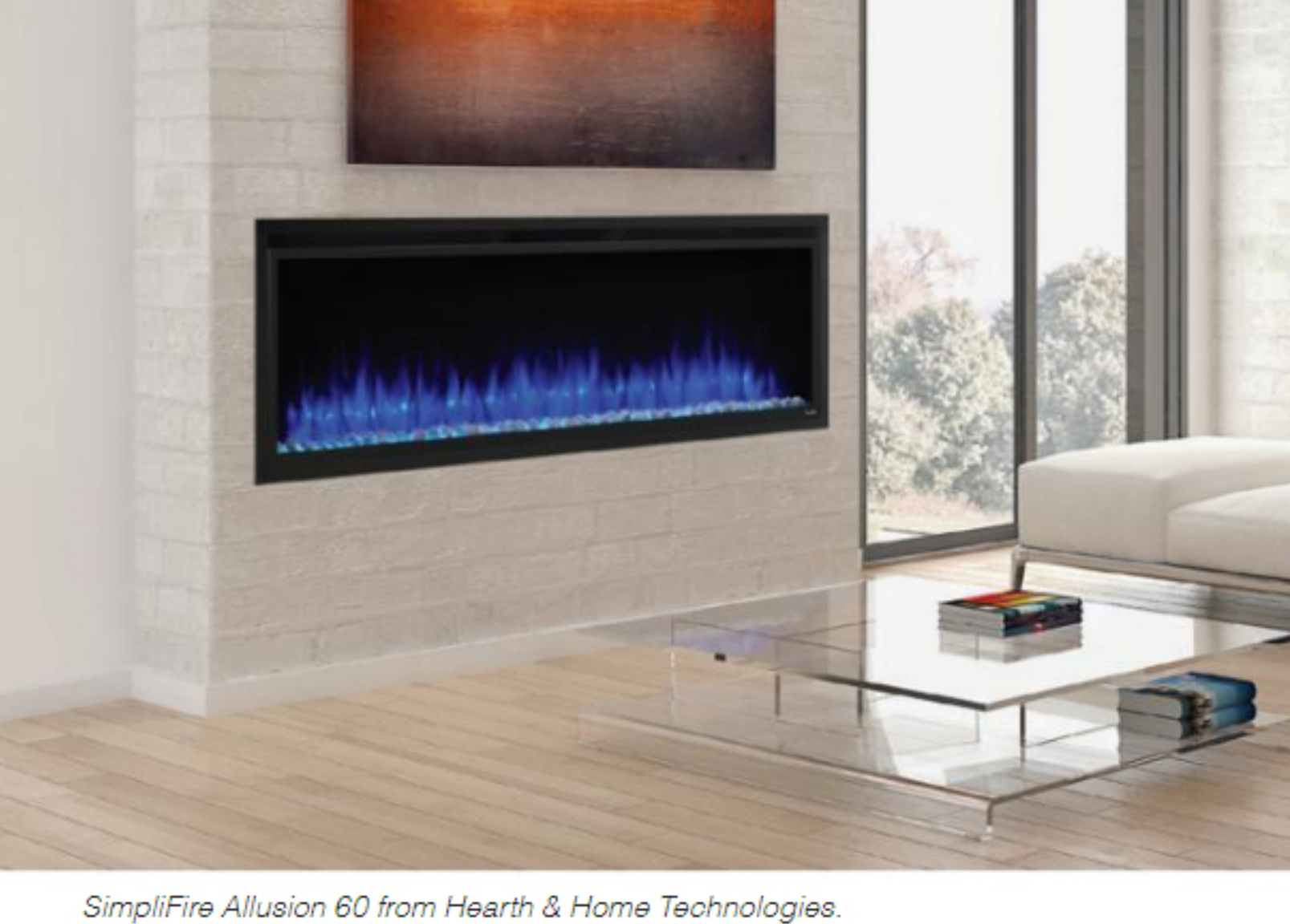
SimpliFire Allusion 60 from Hearth & Home Technologies