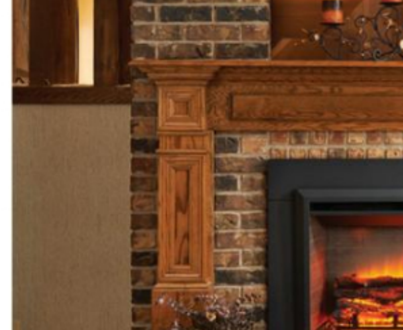
29-inch Electric Fireplace insert from The Outdoor GreatRoom Company

sale instead of the 'cash and carry' models found at the Big Box stores..."