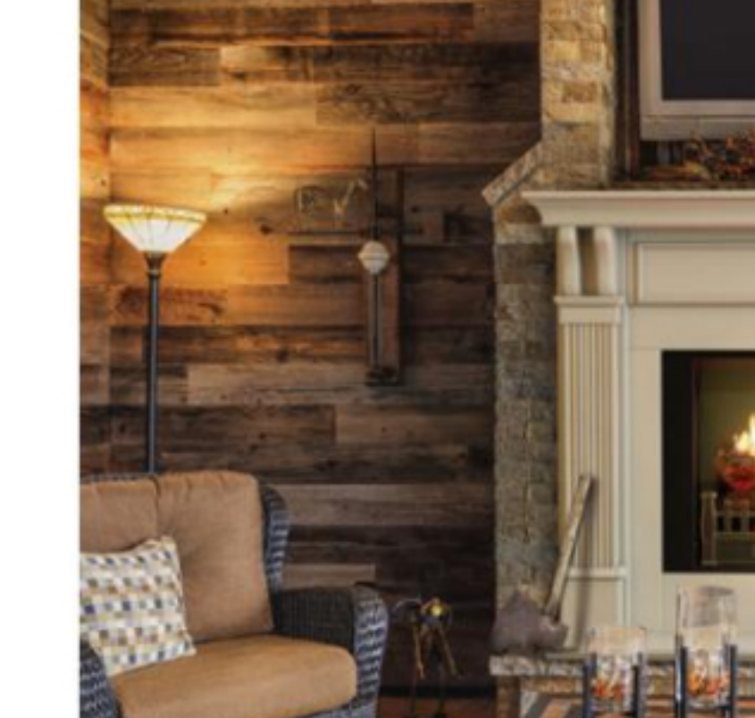
MagikFlame HaloFlame Trinity Electric Fireplace with Mantel Package