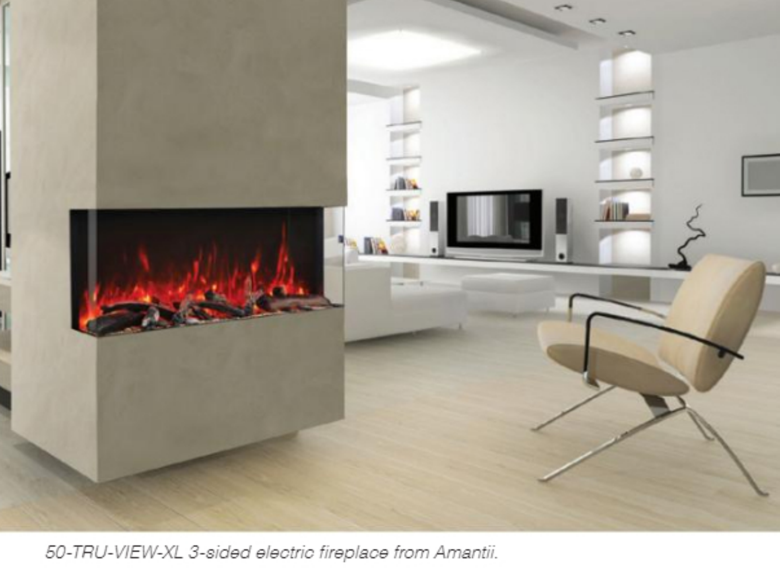
60-TRU-VIEW-XL 3-sided electric fireplace from Amanti

Markham. "We're striving to have our electric fire feature extremely realistic, flickering flames in front of wood panel openings..."