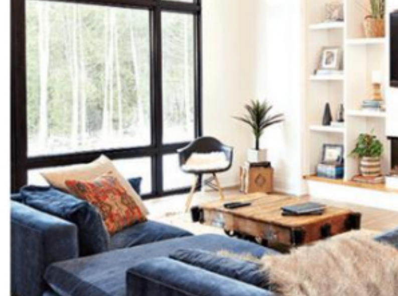
Trivista 3-sided Electric Fireplace from Napoleon Classics

Foy says homebuilders are paying "a lot more attention" to electric fireplaces. "While a builder thinks a fireplace is too expensive, many now are looking at electric models with easier installation..."